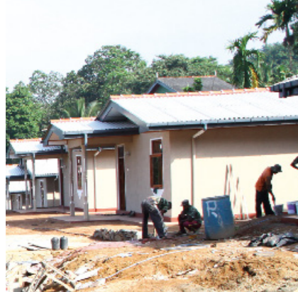
API WENUWEN API MILITARY HOUSING PROJECT